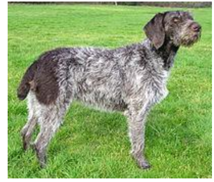
German 1.5 hr B Wirehaired 60$B 70-75$G 1.5 hr B Pointer 2 hr G