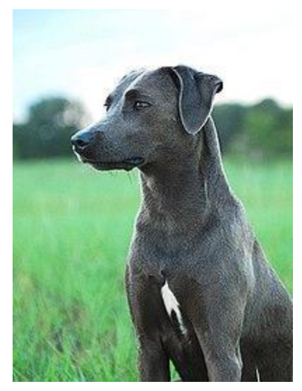
Blue Lacy 55$B 1.5 hr