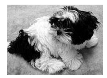
Kyi-Leo 45$B 55-60$$G 1.5 hr B 2 hr G