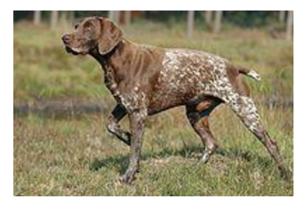
German Shorthaired 55$B 1.5 hr Pointer