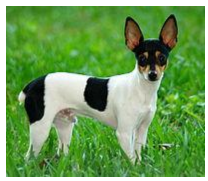
Toy Fox Terrier 45$B

2 hr B 75-80$ G, 2.5 hr G, (or 85-100$ if hair is if coat grown out touches or in bad ground!) shape add 30 min