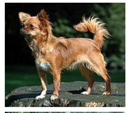
Chihuahua 45$B 50-55$G 1hr B 1.5 hr G