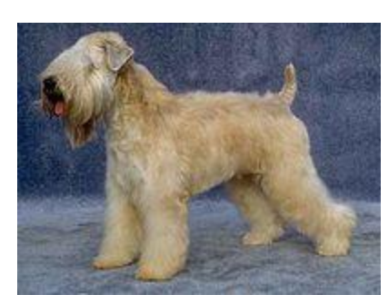
Soft-Coated Wheaten Terrier