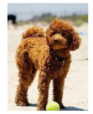
Mini & Toy Poodle