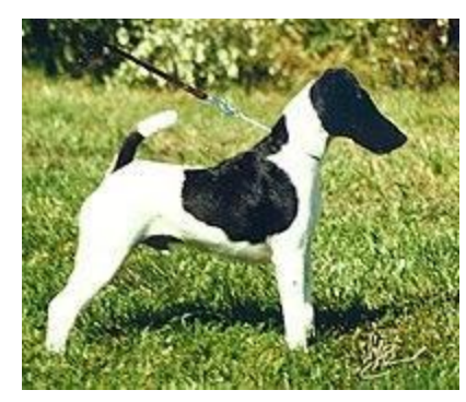
Fox Terrier, Smooth