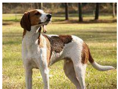
Treeing Walker 55$