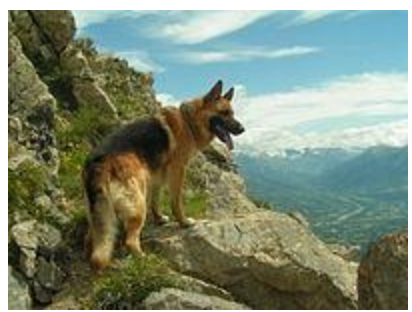
German Shepherd Dog 65-75$B 2 hr