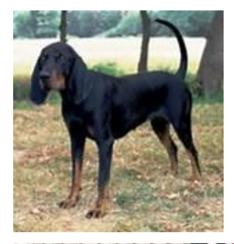
Black and Tan Virginia Foxhound