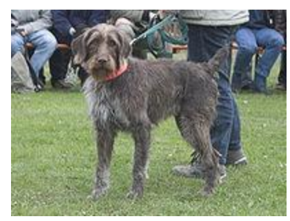
German Roughhaired 60$B 70-75$G 1.5 hr B Pointer 2 hr G