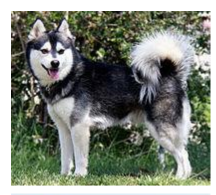
Alaskan Klee Kai