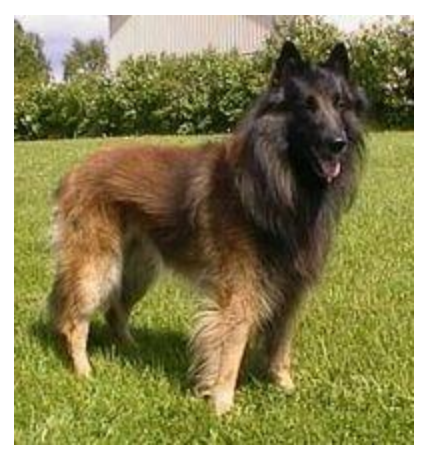
Belgian Shepherd Dog 65-70$B 75-85$B 2.5 G (Tervuren)