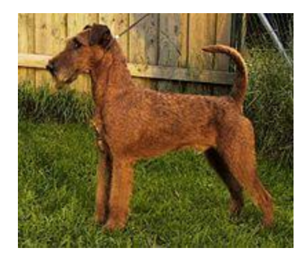
Irish Terrier 45$B 55$G 1hr B 1.5hr G