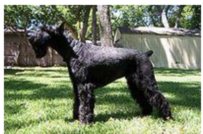
Giant 60-70$B 75-90$G 2 hr B 2.5 / 3 hr G