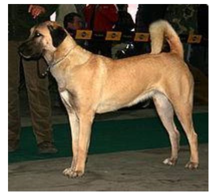
Anatolian Shepherd Dog